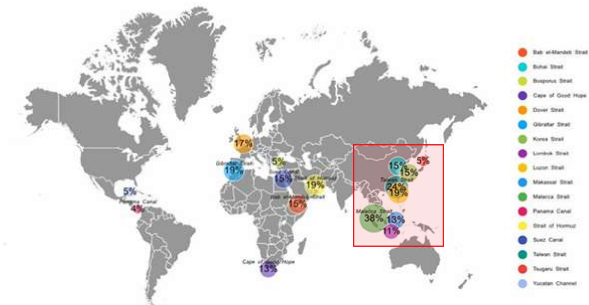
Figure 2 Most of Maritime Trade Goes Through a Few Chokepoints 図 2 世界の海上輸送における難所とも呼べる渋滞が危険視される要衝

Note: This map represents the list of chokepoints identified by the IMF for which the share of 2023 total maritime trade is higher than 5% as well as the Panama Canal. Shares were calculated as the ratio of the volume of trade going through each chokepoint to the 2023 total volume of maritime trade. The volume of trade going through each chokepoint is estimated by the IMF using AIS data transmitted from vessels and collected by the UN Global Platform. 2023 total volume of maritime trade was estimated using 2021 total maritime trade from UNCTAD database and yearly growth rates provided in UNCTAD maritime trade reports. Source: Author's elaboration based on IMF Portwatch (data extracted on 10 September 2024) and UNCTAD.