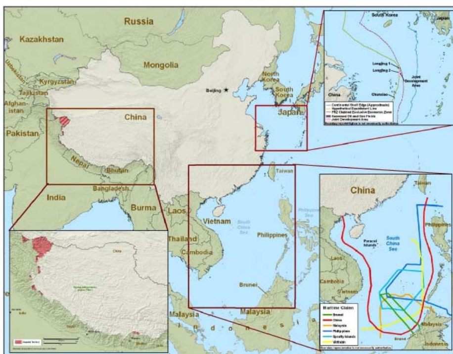
Figure 2. China's Disputed Territories

China's Disputed Territories. This map is an approximate presentation of PRC and other regional claims. China has remained ambiguous on the extent and legal justification for these regional claims. Three of China's major ongoing territorial disputes are based on claims along its shared border with India and Bhutan, the South China Sea, and with Japan in the East China Sea.